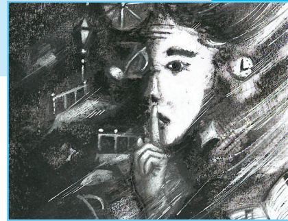
TOI TOI Teatru Manoel Education Programme

Gus Nightingale is a little boy from a very famous musical family, but when his mother dies, all music is banned from his house. After he is dreadfully humiliated by The Maestro, Gus decides the safest option is to stop speaking and singing - in effect to HUSH! One day, Gus passes the old music shop and finds it open. Inside, he finds broken and unwanted instruments, an antique conductor's baton with some sort of magical power, and a girl called Clementine Pickles. Clementine shows Gus how it is possible to play beautiful music even on broken instruments but as Gus is leaving, an evil stranger enters the shop, locks Clementine in a cello case, steals her voice and the precious baton! This evil stranger uses the baton to extract sounds from everyone and everything - leaving the world a completely silent place. A hush has fallen. A plan unfolds. A voice is forgotten. It is now up to Gus to figure out a way of releasing all sounds back to their rightful owners.