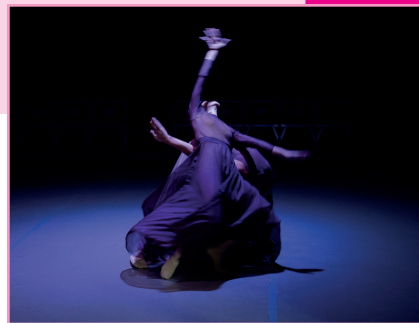
MOVEO AT TOI TOI: Teatru Manoel Education Programme

Pandora's Box deals with how 2 people react and/or are affected by three main issues that children and adolescents are faced with in today's day and age; family issues, social media (mainly the selfie) and puberty. Each issue is locked in a box which once opened hits the performers and from there the impact is felt. Different people react in different ways to these pressures. Despite all this, just as with Pandora's Box, the last element is hope and the performance comes to an end on a positive note.