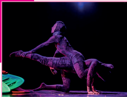
MOVEO Dance Company

Blooming creatures explores how various living creatures interact with their surrounding environment, through dance. Each creature develops a unique interaction with its surrounding habitat depending on its requirements, be it nutrition, oxygen or for the mere form of survival. We explore how animals and plants interact, in some cases making them interdependent for nutrition, respiration, or reproduction. We present the organised body of knowledge that deals with the relationships between living organisms and their environments. The realm of ecology involves a systematic analysis of plant-animal interactions through the considerations of nutrient flow in food chains and webs, exchanging important gases like oxygen and carbon dioxide between plants and animals, and strategies of mutual survival through the processes of pollination and seed dispersal. All this is explored through dance and explored, by the students, in a very interesting hands on workshop at Esplora.