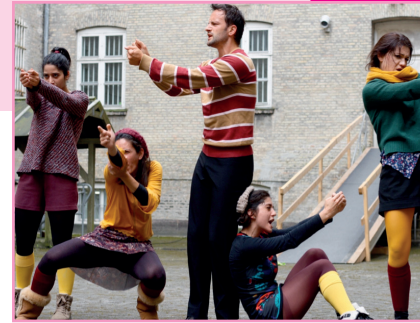
MOVEO Dance Company

We are providing you with this varied Programme of Events for the period October 2017 - June 2018. As you leaf through this publication, you can see that activities are divided according to artistic genres. Please read the description on each activity which will help you choose which event is most suited to your students.